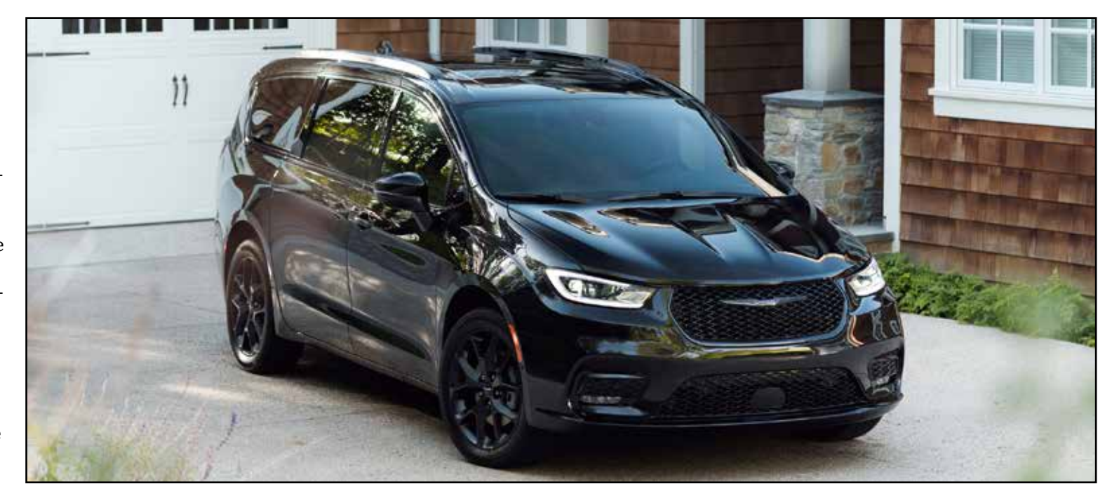
The 2025 Chrysler Pacifica Limited now comes standard with the S appearance package, giving it a sportier look with blacked-out trim.

The optional all-wheeldrive system provides welcome peace of mind in inclement weather. Unlike some competitors' AWD set-