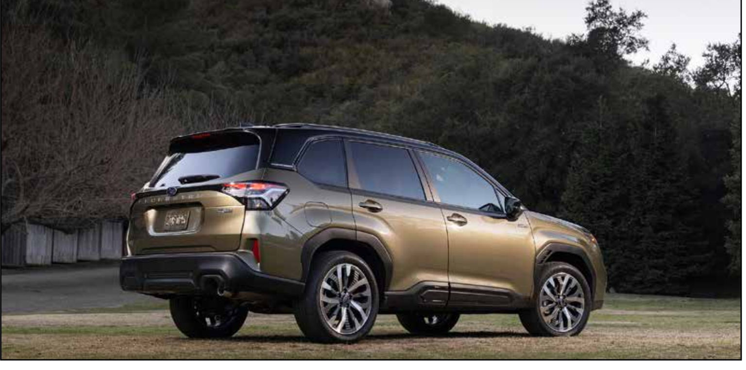
The 2025 Subaru Forester Hybrid maintains the model's upright, practical shape while adding hybrid badges and unique wheels that hint at its improved efficiency.

Where the Forester continues to excel is its exceptional utility. The boxy,