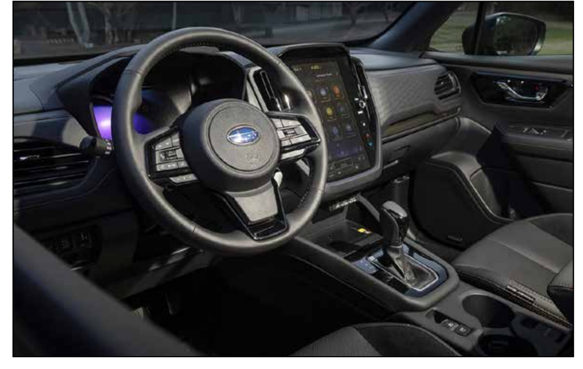
With its spacious, airy cabin and new digital displays, the Forester Hybrid prioritizes visibility, comfort and user-friendly technology over flashy design elements.

With rear seats folded, the flat load floor and wide opening make it ideal for hauling bulky items that wouldn't fit in sleeker-styled competitors.