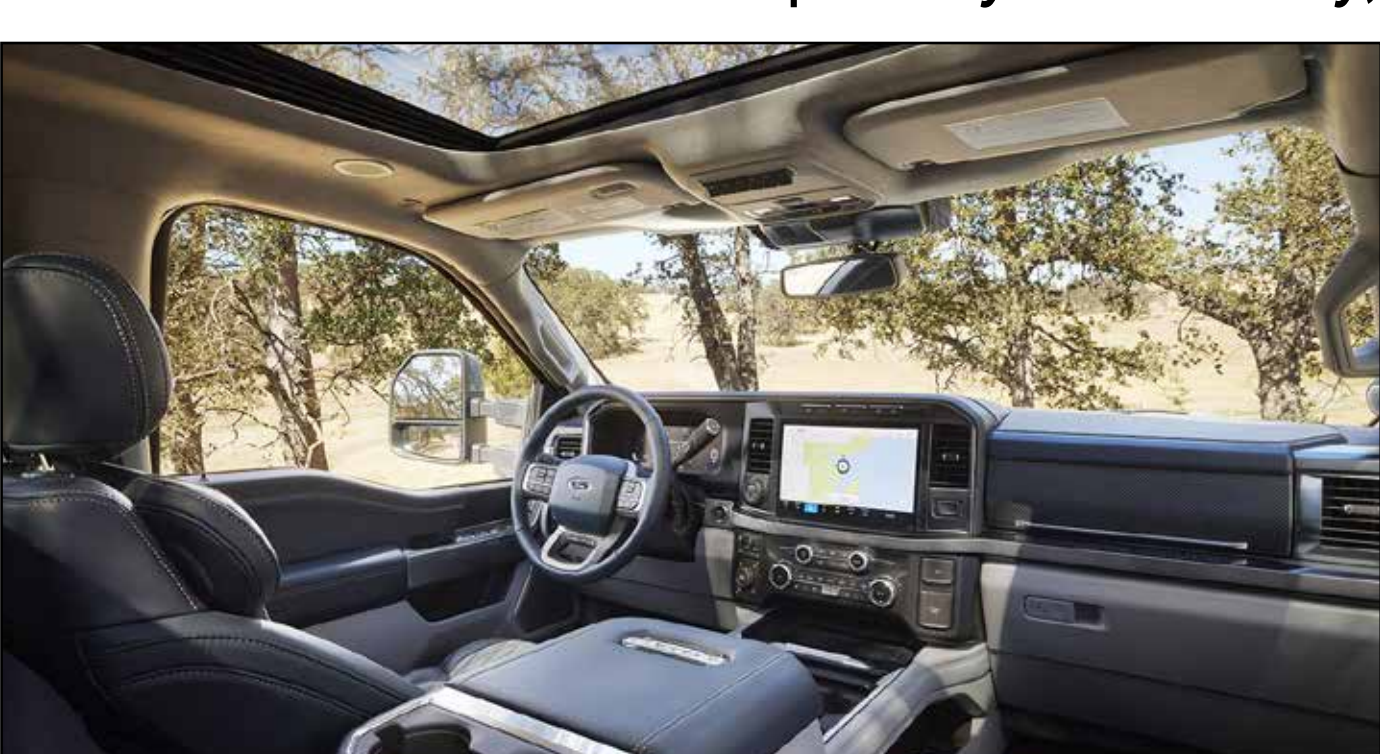
The F-350 Limited's well-appointed cabin blends premium materials with the latest tech like digital widescreen displays and massaging leather seats.

The handsome cabin is awash in premium materials like real wood and leather, plus all the latest tech including digital widescreen displays and generous info-