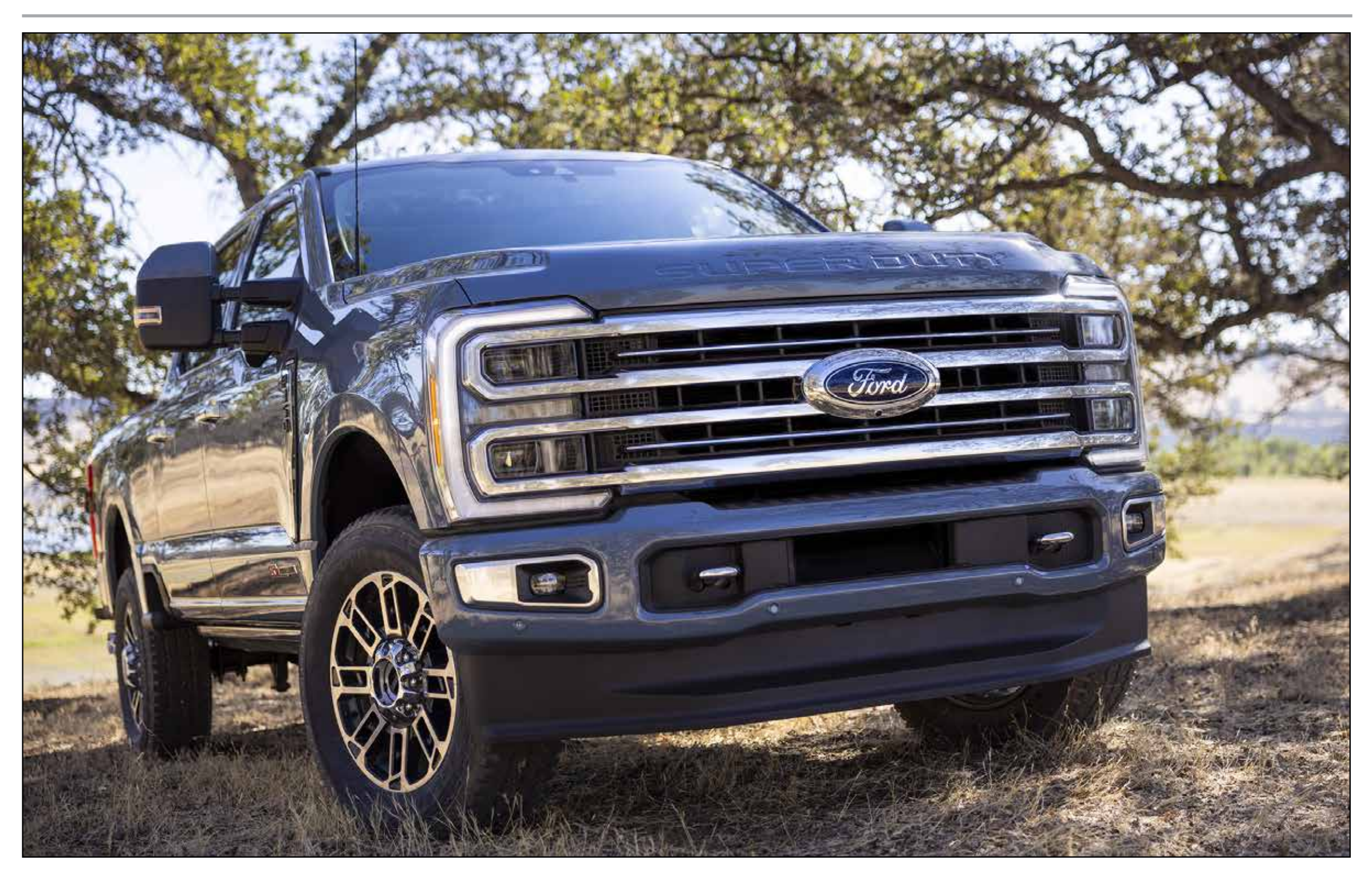
With its imposing dimensions and premium details like LED lighting and bold wheels, the luxurious F-350 Limited cuts an undeniably commanding presence.