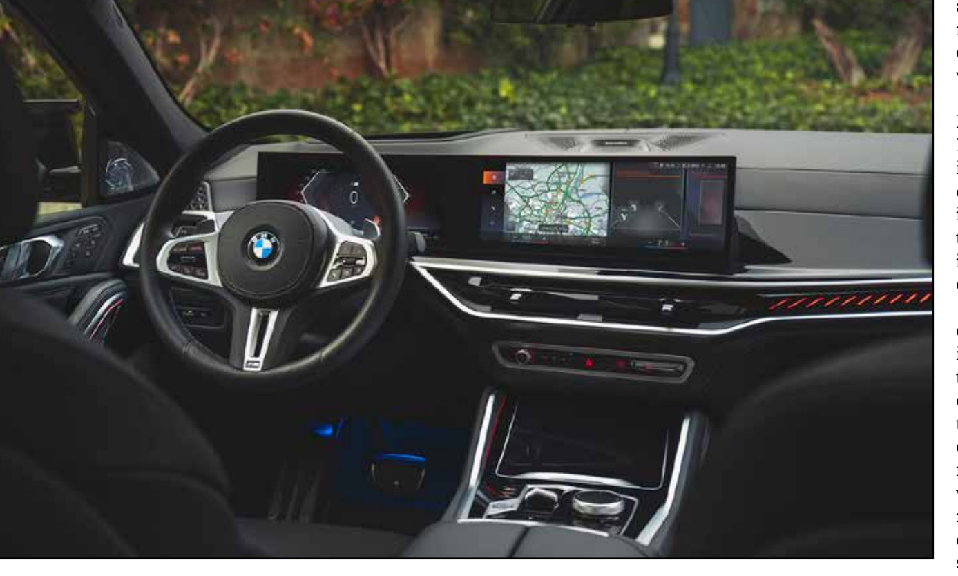
An elegantly crafted cabin features the advanced BMW Curved Display, merging luxury with cutting-edge technology.

The integration of 48V mild-hybrid technology not only boosts its efficiency but also enhances the engine's response and power deliv-