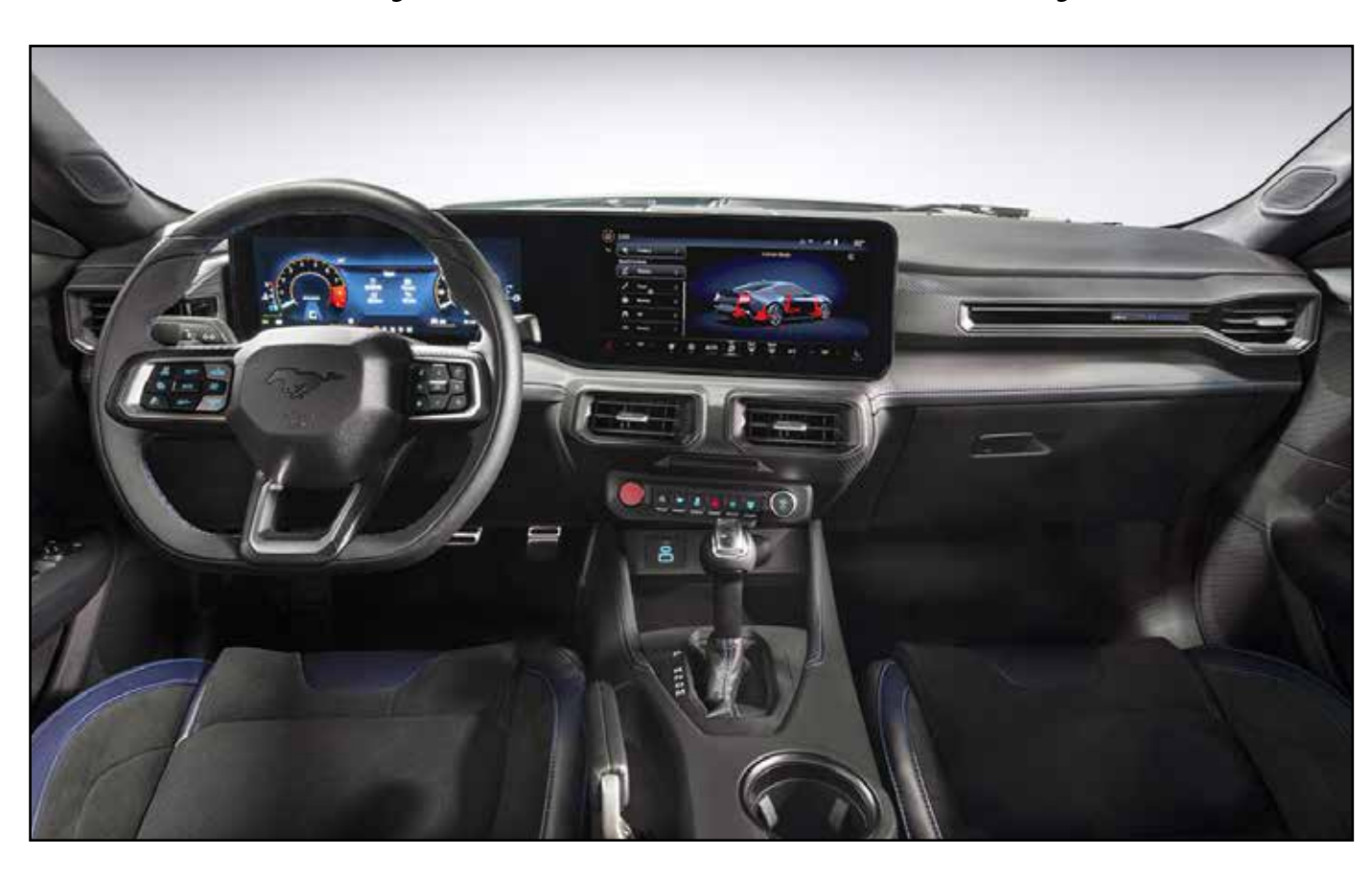
The Dark Horse's cockpit blends racy cues like available Recaro seats and contrast stitching with surprising comfort and refinement for daily driving.

But the real magic happens when you summon the Dark Horse's 500-horsepower 5.0-liter