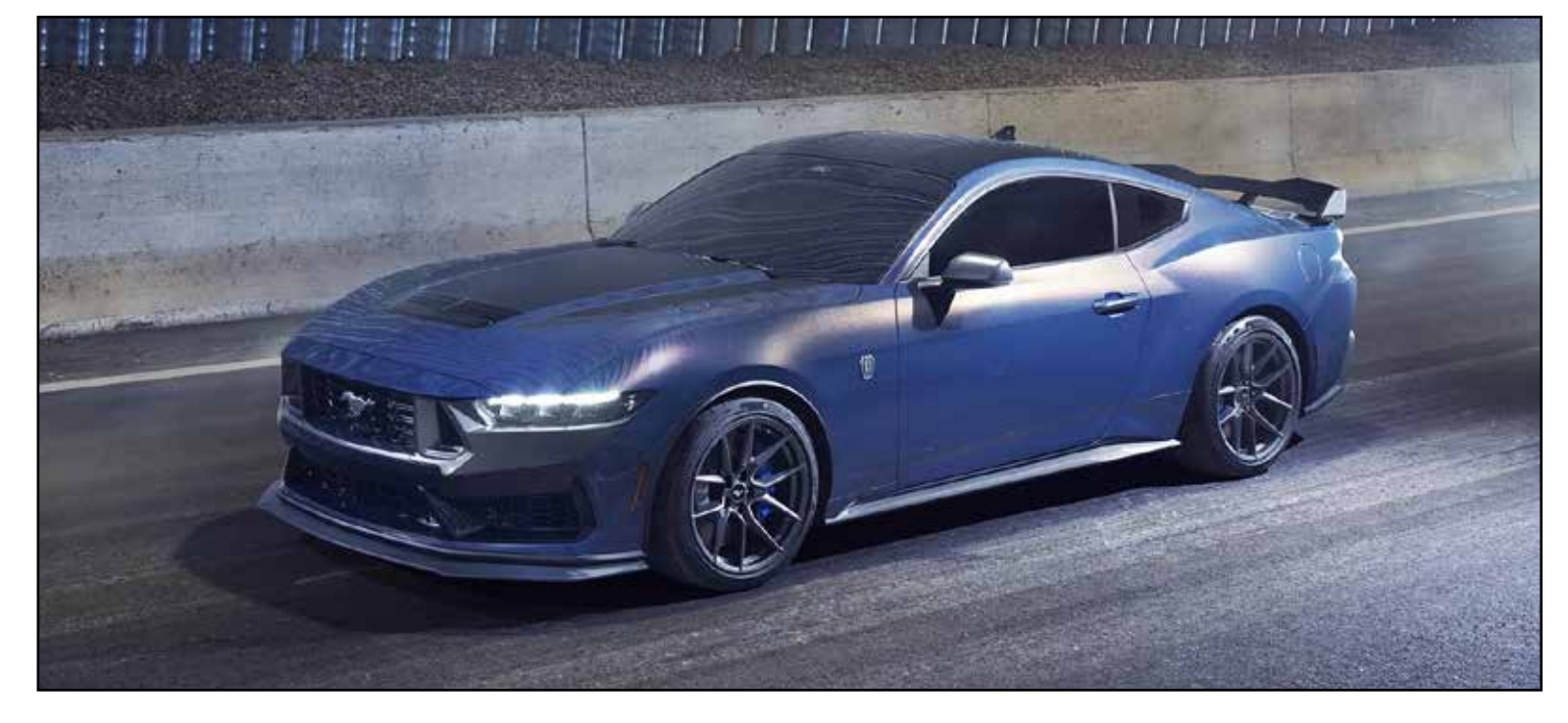
With its gloss black grille, darkened headlights and aggressive front splitter, the 2024 Ford Mustang Dark Horse has a menacing presence that hints at its track-honed performance.

pens when you summon the Dark Horse's 500-horsepower 5.0-liter V8 to life. While only 14 horses stronger than the standard GT's engine, the Dark Horse's specially modified Coyote V8 feels utterly unhinged in its ferocity.