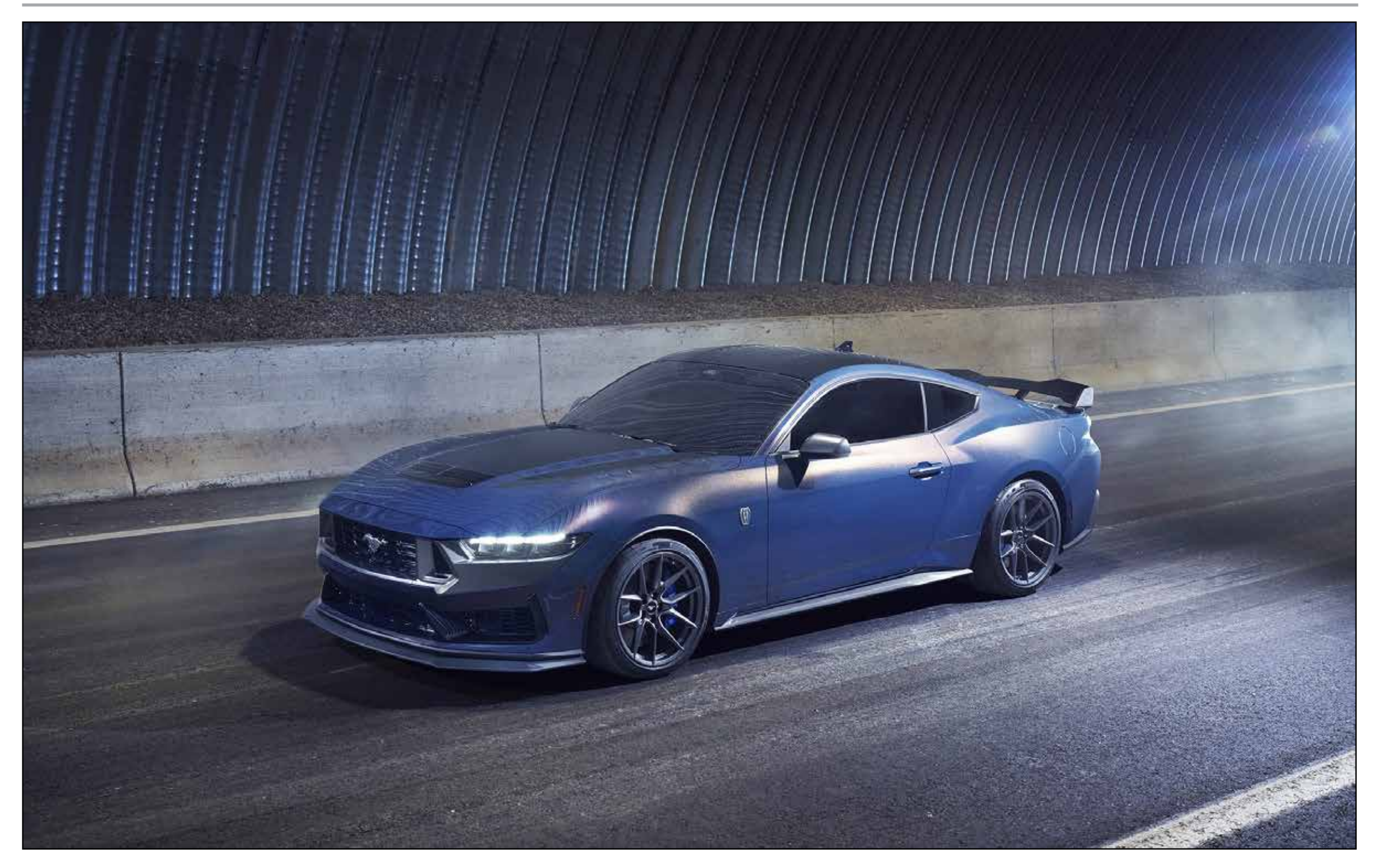
With its gloss black grille, darkened headlights and aggressive front splitter, the 2024 Ford Mustang Dark Horse has a menacing presence that hints at its track-honed performance.