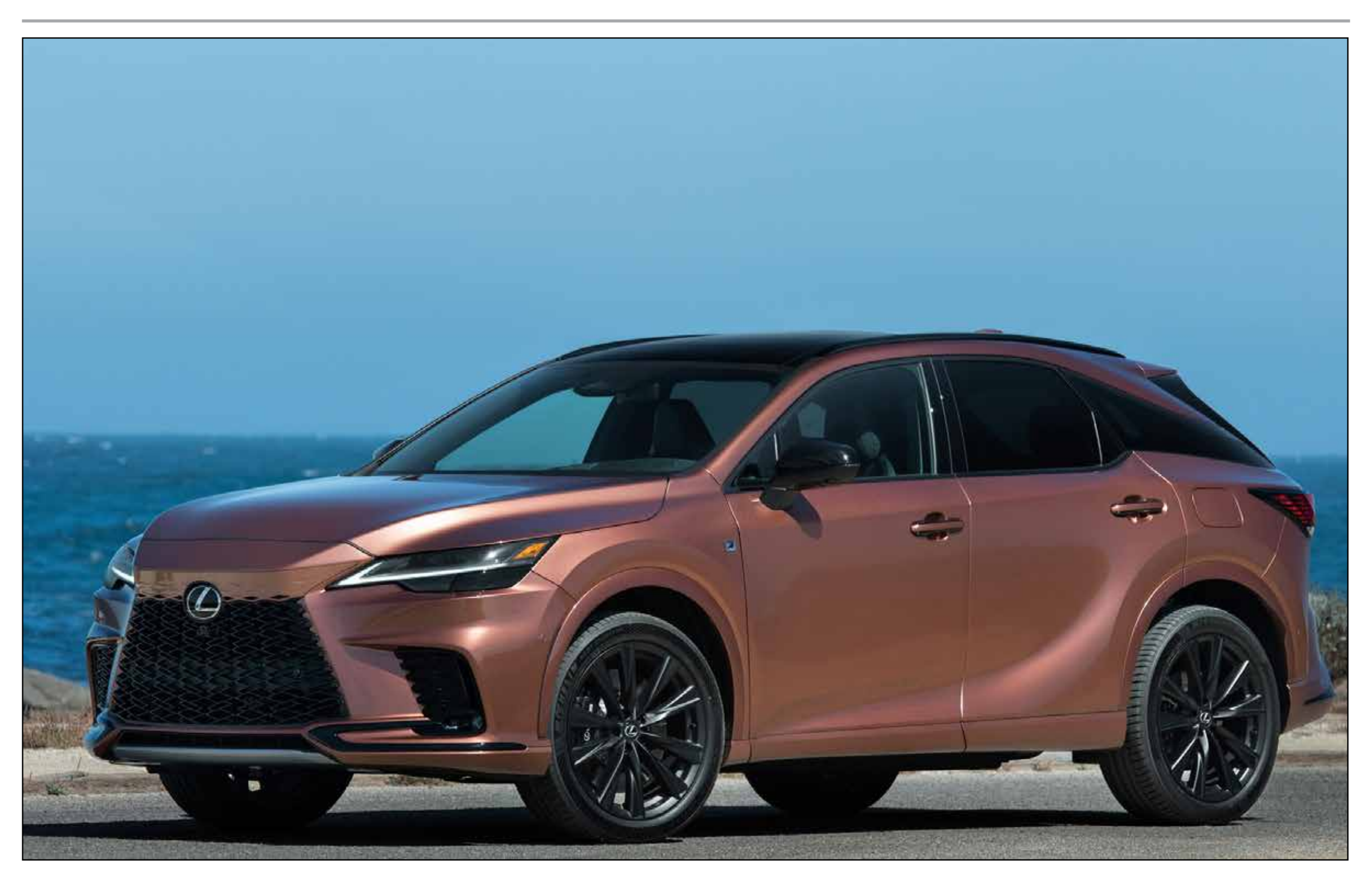
The 2024 Lexus RX's bold styling turns heads, but its aggressive looks belie the crossover's emphasis on comfort and isolation over athleticism.