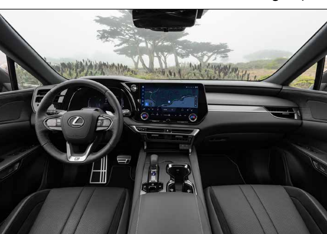
A focus on craftsmanship and intuitive tech define the 2024 Lexus RX's plush, well-appointed cabin.

The available 14-inch infotainment screen is a standout feature, with intuitive controls and crisp graphics that make navigating the