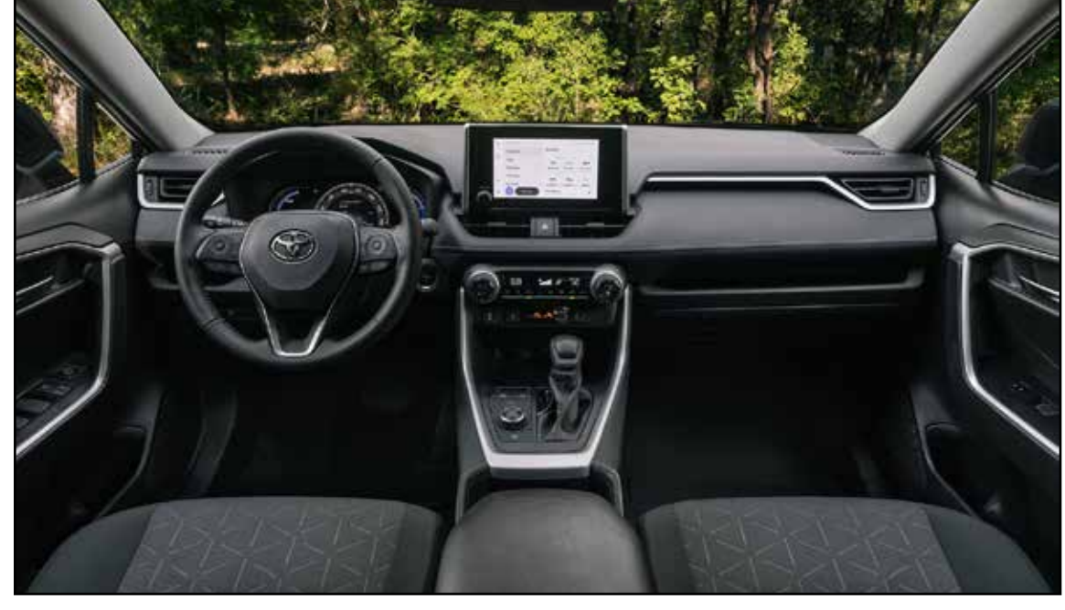
The RAV4 Hybrid Woodland's cabin prioritizes functionality and comfort, with intuitive controls and ample cargo space for outdoor adventures.

Where the Woodland Edition sets itself apart is in its off-road-oriented additions. The TRD-tuned suspension, all-terrain tires, and increased ground clearance give this RAV4 more capability when the pavement ends. While it's not a hardcore trail