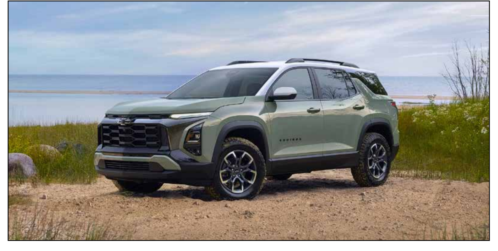
The redesigned 2025 Chevrolet Equinox showcases an expressive new exterior with bold bodylines, pronounced fender flares and a distinctly truckish profile.

Inside, the Equinox continues the more modern design language found in