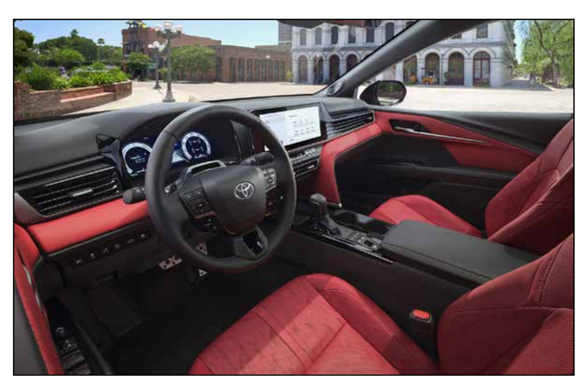
Bold red leather upholstery and a 12.3-inch touchscreen highlight the Camry XSE's premium cabin, which features upgraded materials and improved ergonomics.

The Camry's greatest strength is its com-