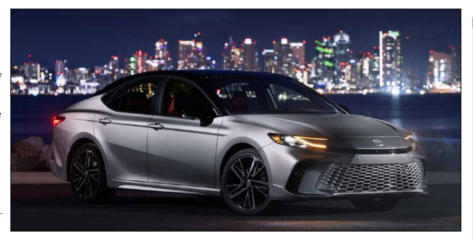
The 2025 Camry XSE features aggressive styling elements including a black sport mesh grille, 19-inch smoke gray wheels and an available two-tone paint scheme with black roof.

Efficiency is impressive, with our sportier XSE trim rated at 48 mpg city, 47 highway. Lower trims do even