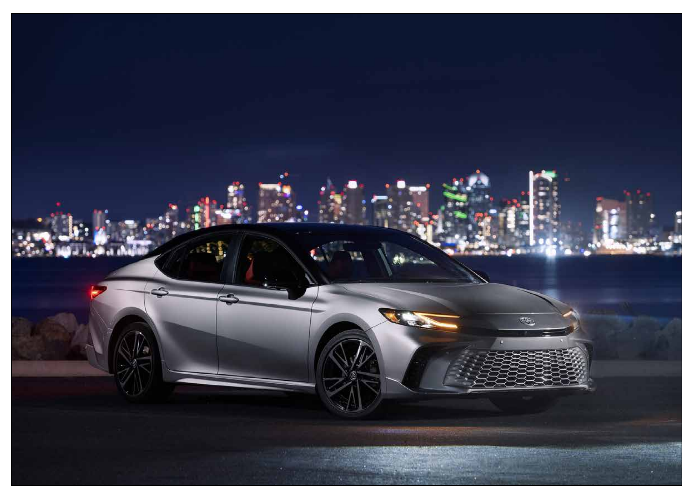
The 2025 Camry XSE features aggressive styling elements including a black sport mesh grille, 19-inch smoke gray wheels and an available two-tone paint scheme with black roof.