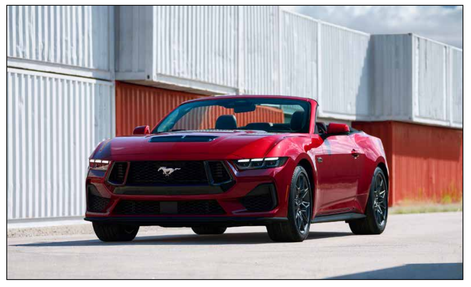
Revised styling in the latest Mustang maintains its DNA while adding contemporary details and improved aerodynamics.

Traditional Mustang design cues remain, including the dual-cowl dashboard and toggle switches.