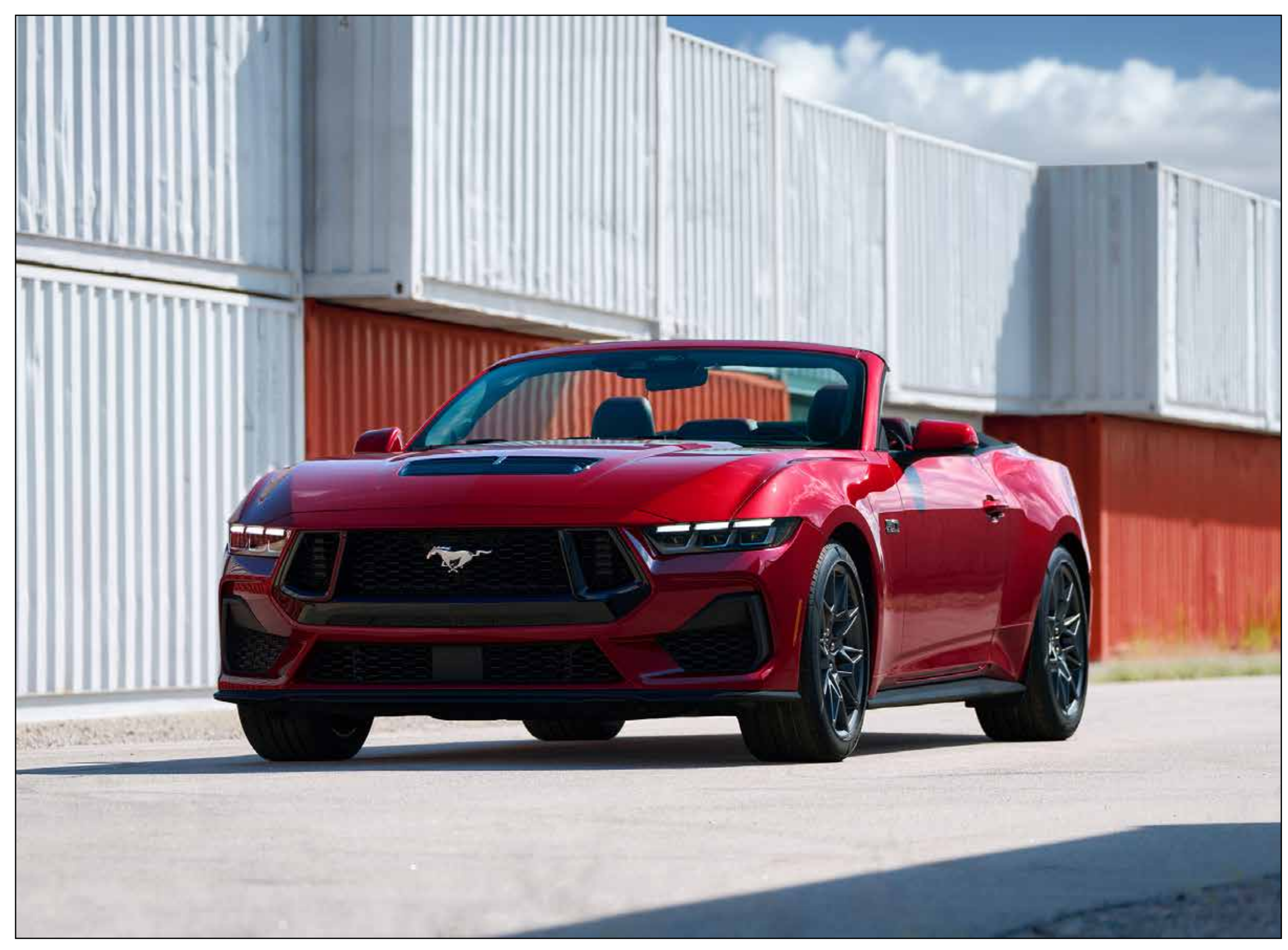
Revised styling in the new-generation Mustang maintains its DNA while adding contemporary details and improved aerodynamics.