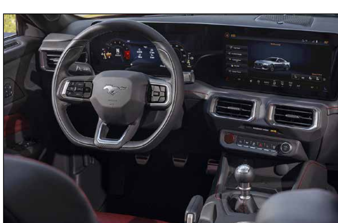
New digital displays dominate the cabin, but traditional performance touches remain. The new cabin does a good job bridging heritage and technology.

Traditional Mustang design cues remain, including the dual-cowl dashboard and toggle switches. Material quality has improved,