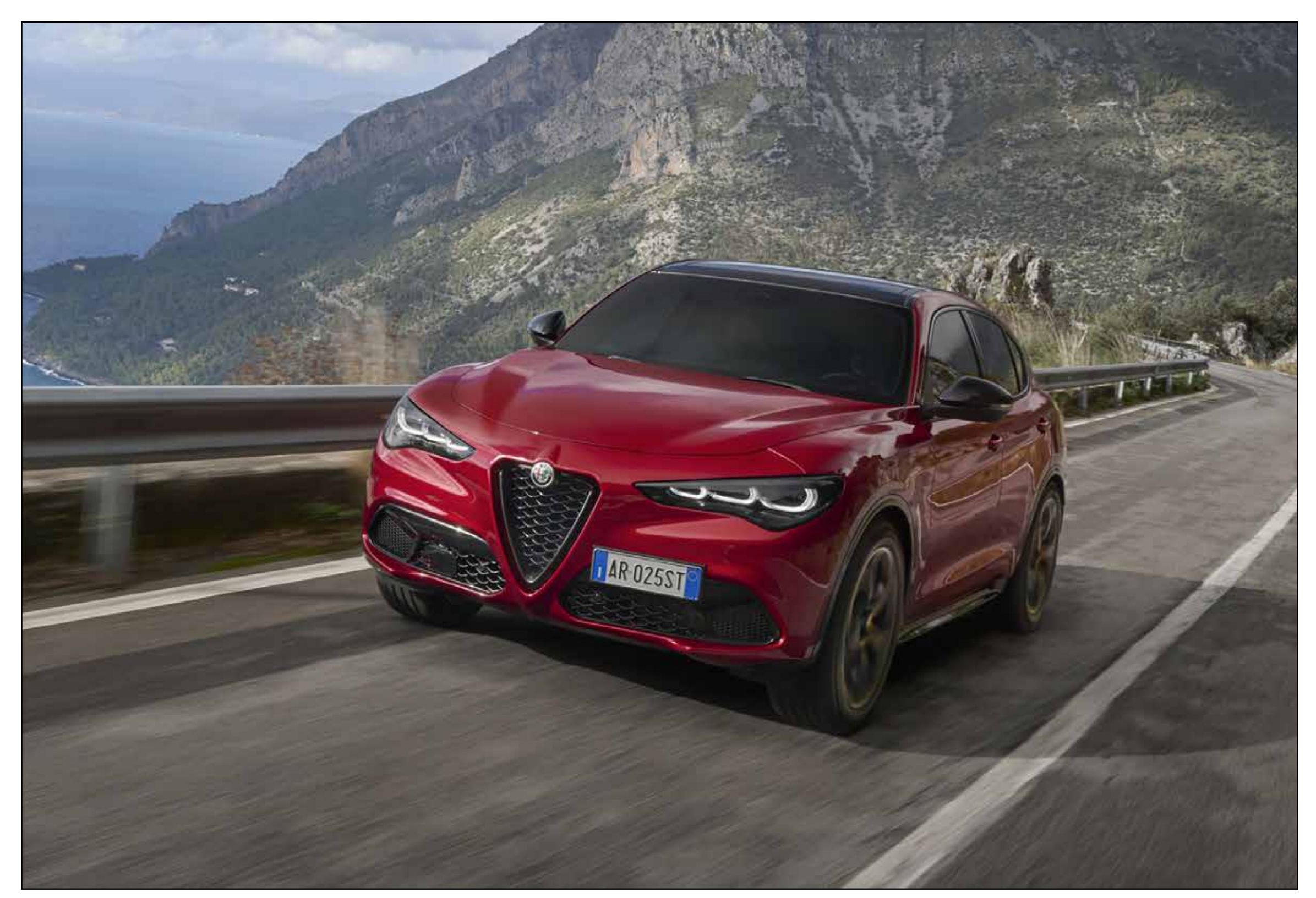
Striking design elements and optional 20-inch wheels emphasize Stelvio's sporting character.