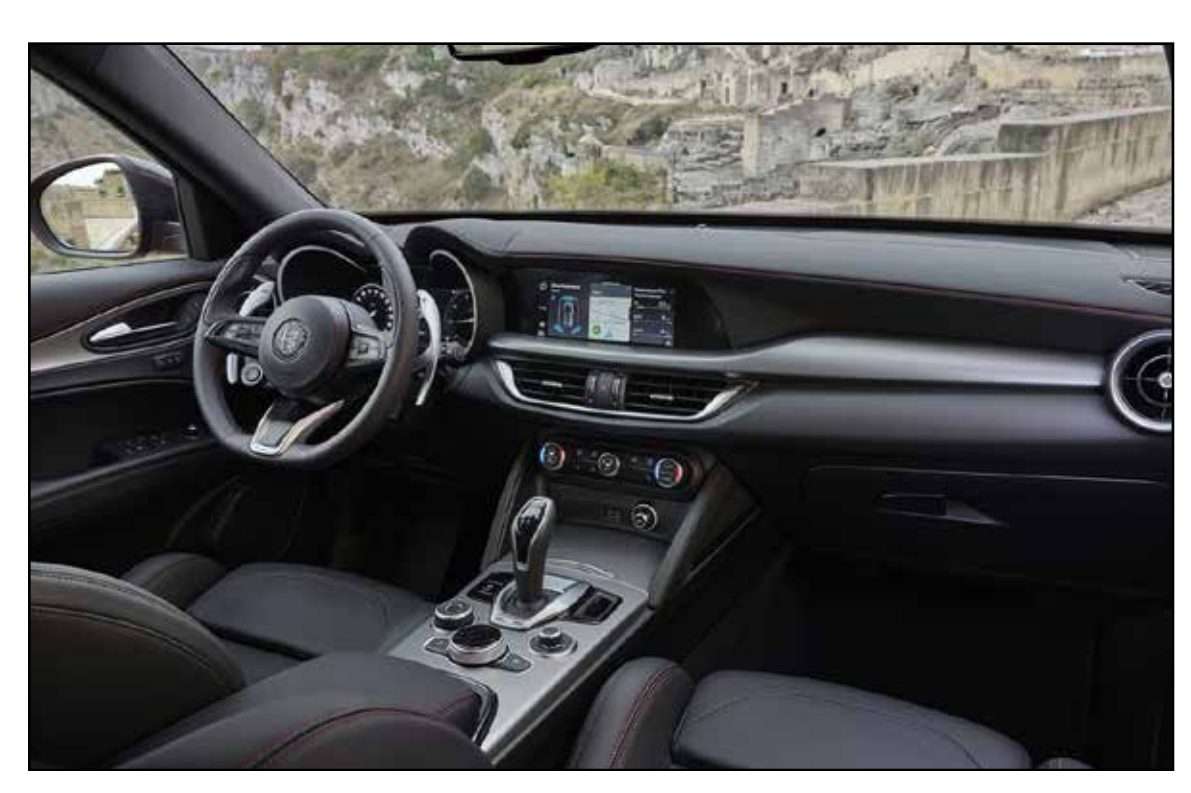
A driver-focused cockpit features new digital displays while maintaining traditional Alfa Romeo touches.

Inside, the 12.3-inch digital instrument cluster impresses with its configurable displays and crisp graphics. Three distinct layouts - Evolved, Relax, and Heritage - allow drivers to prioritize different information.