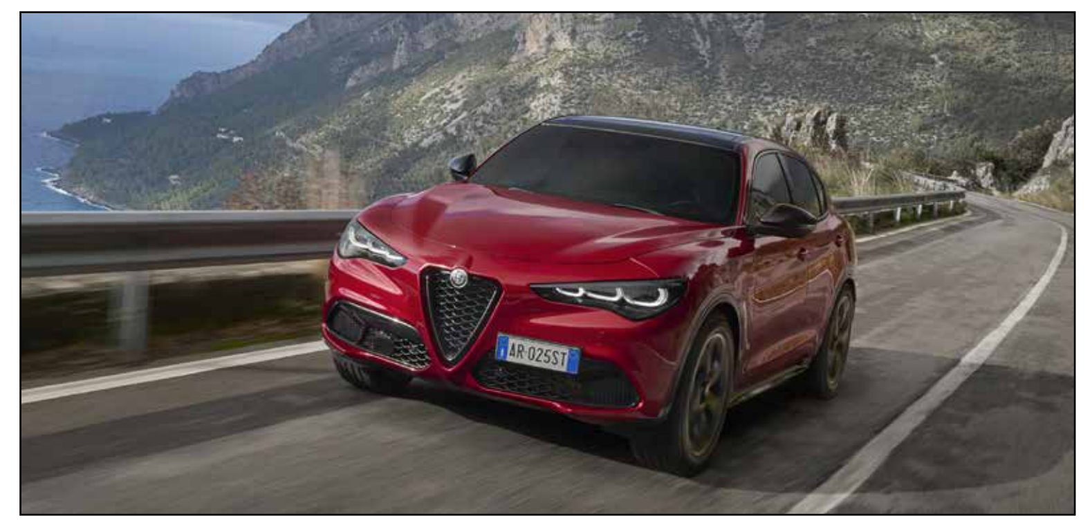
Striking design elements and optional 20-inch wheels emphasize Stelvio's sporting character.

tal instrument cluster impresses with its configurable displays and crisp graphics. Three distinct layouts – Evolved, Relax, and Heritage – allow drivers to prioritize different information. The Heritage mode, with its inverted numbers reminiscent of classic Alfas, adds particular charm.