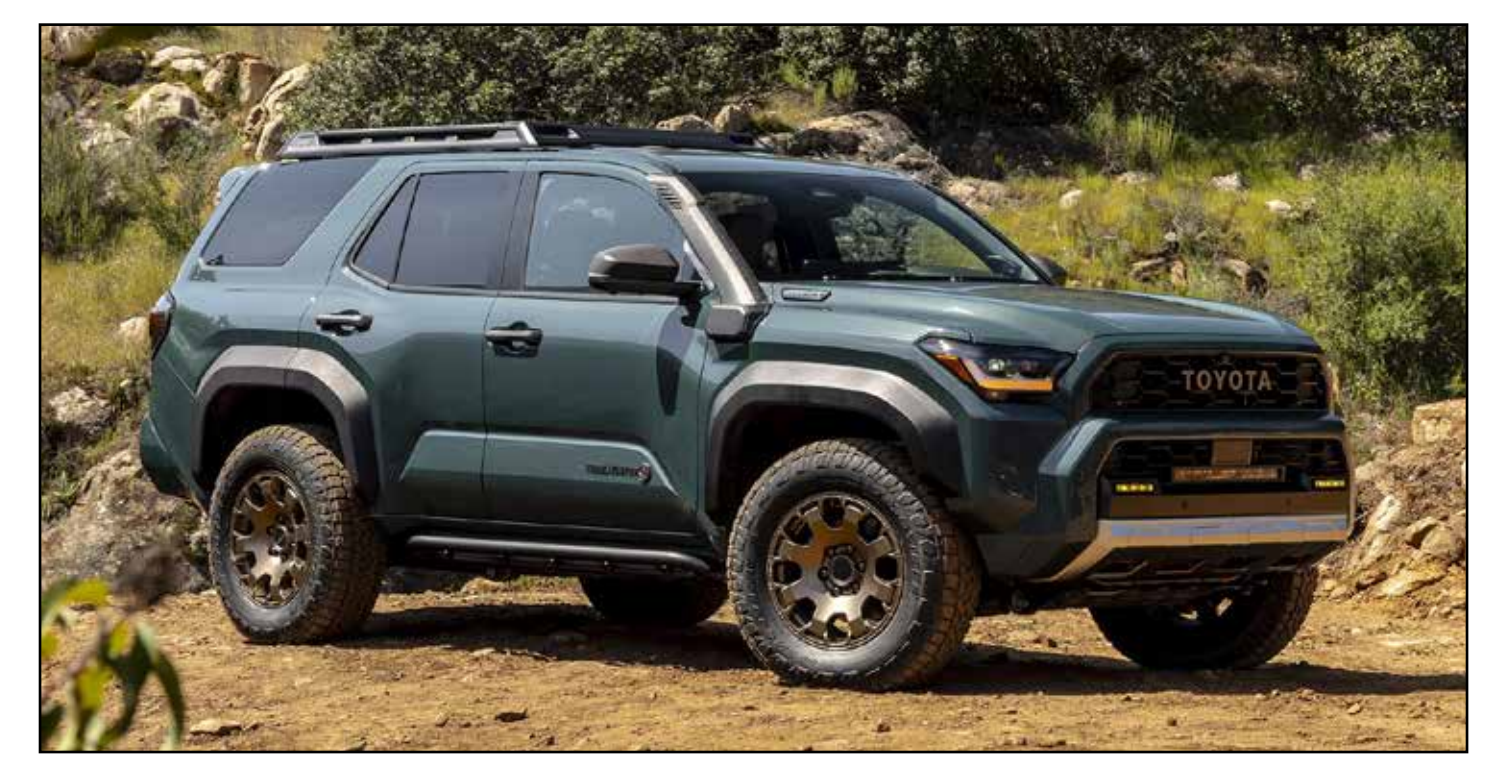
The 2025 4Runner Trailhunter's bronze accents and aggressive stance signal serious off-road intent while maintaining the boxy proportions that define the 4Runner aesthetic.

The body-on-frame construction creates a distinctly different driving