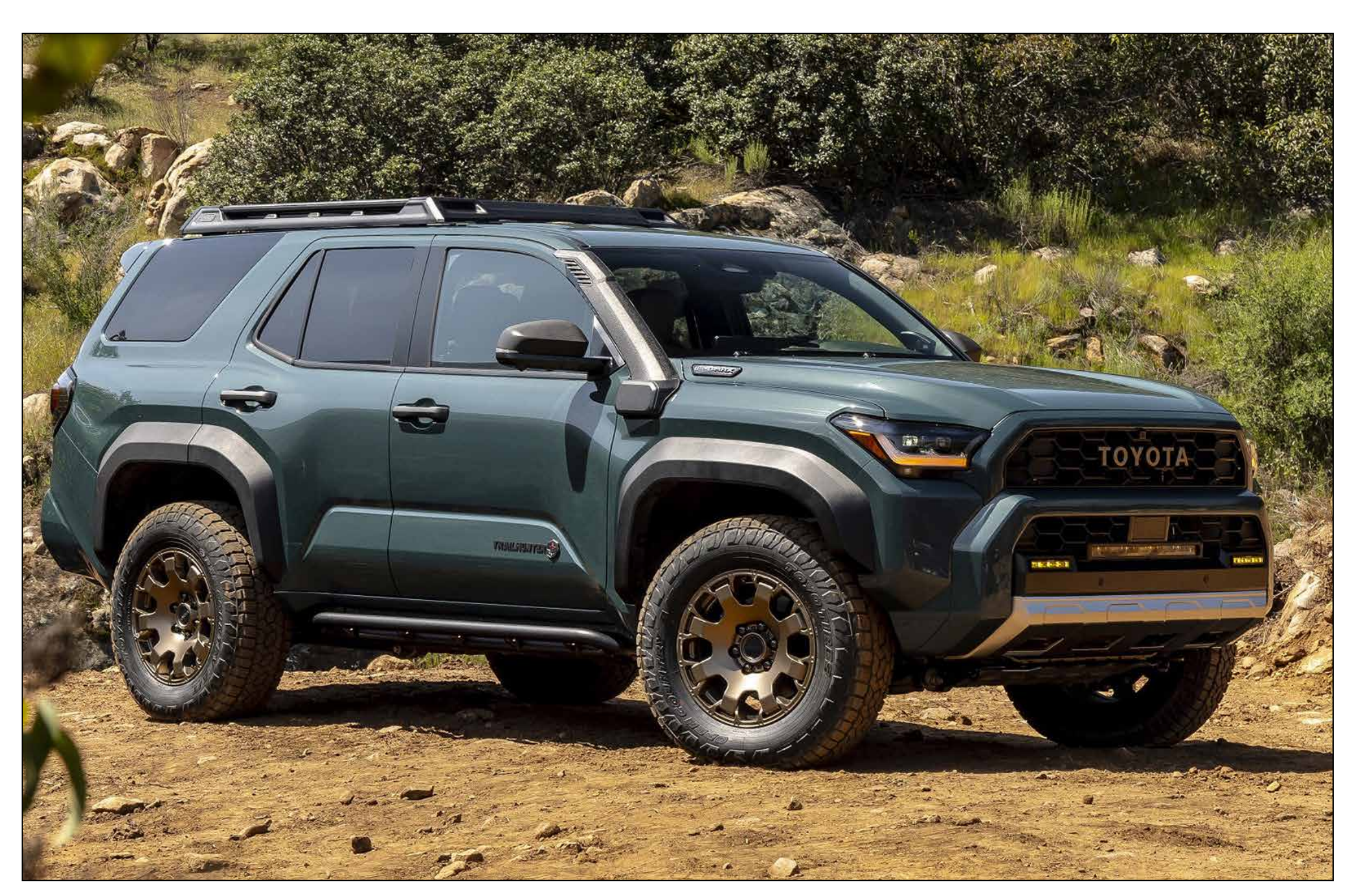
The 2025 4Runner Trailhunter's bronze accents and aggressive stance signal serious off-road intent while maintaining the boxy proportions that define the 4Runner aesthetic.