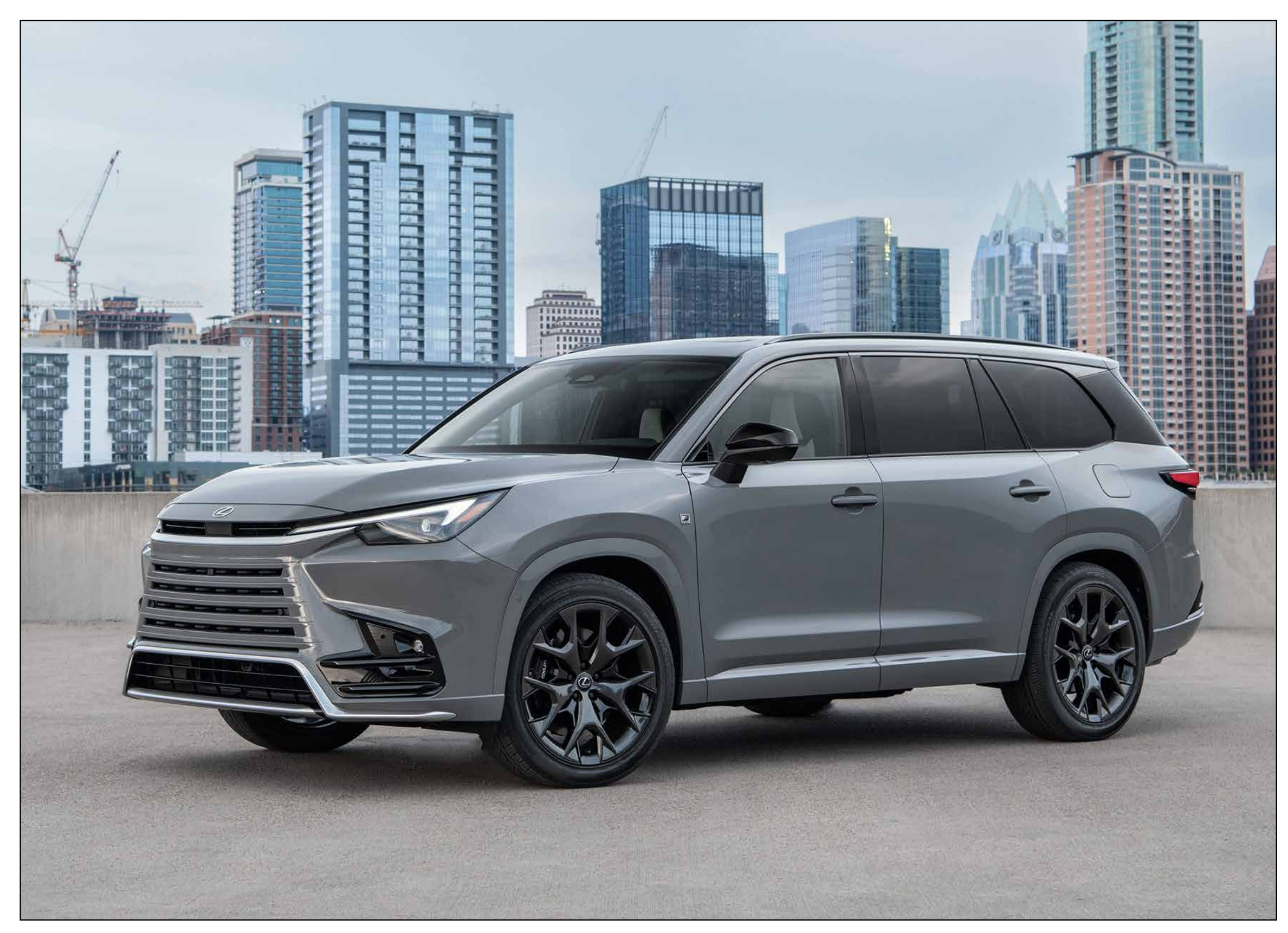
The 2025 Lexus TX F SPORT Handling comes with 22-inch matte black wheels and sportier styling while maintaining the three-row SUV's emphasis on comfort.