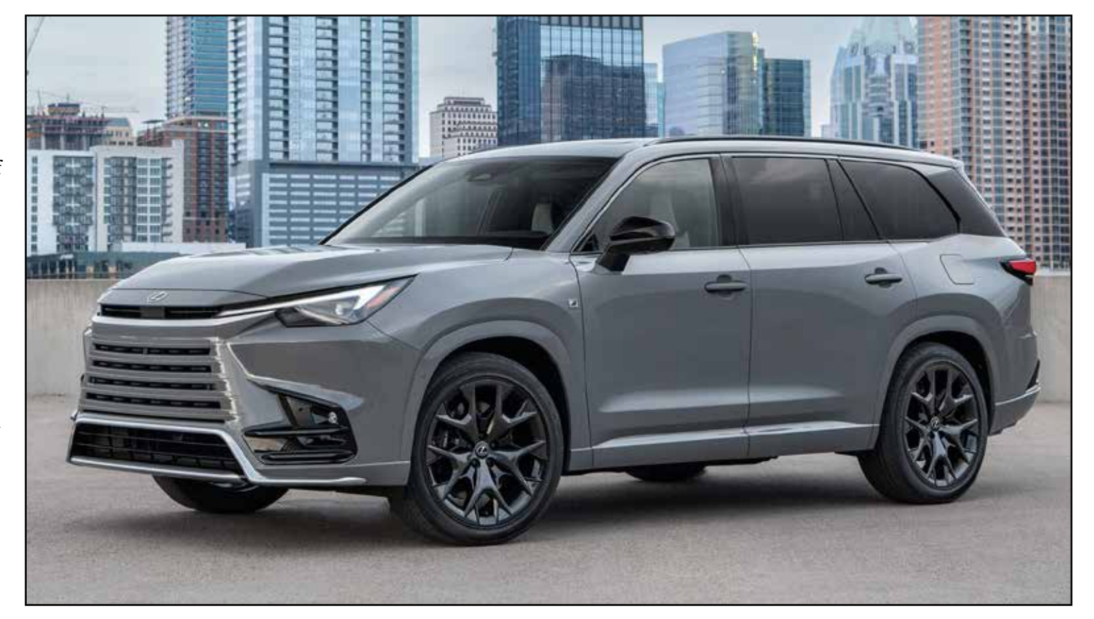
The 2025 Lexus TX F SPORT Handling comes with 22-inch matte black wheels and sportier styling while maintaining the three-row SUV's emphasis on comfort.

While these additions provided a more dynamic appearance on my tester, the TX's greatest strength remains its trademark smoothness and refine-