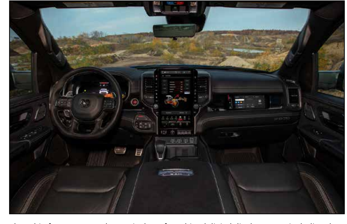
The cabin features more than 50 inches of combined digital display space, including the massive 14.5-inch center touchscreen and available massage seats that make long drives surprisingly comfortable.

impacts. Ground clearance stands at 11.8 inches – 2 inches higher than standard Ram 1500s – enabling the RHO to clear obstacles that