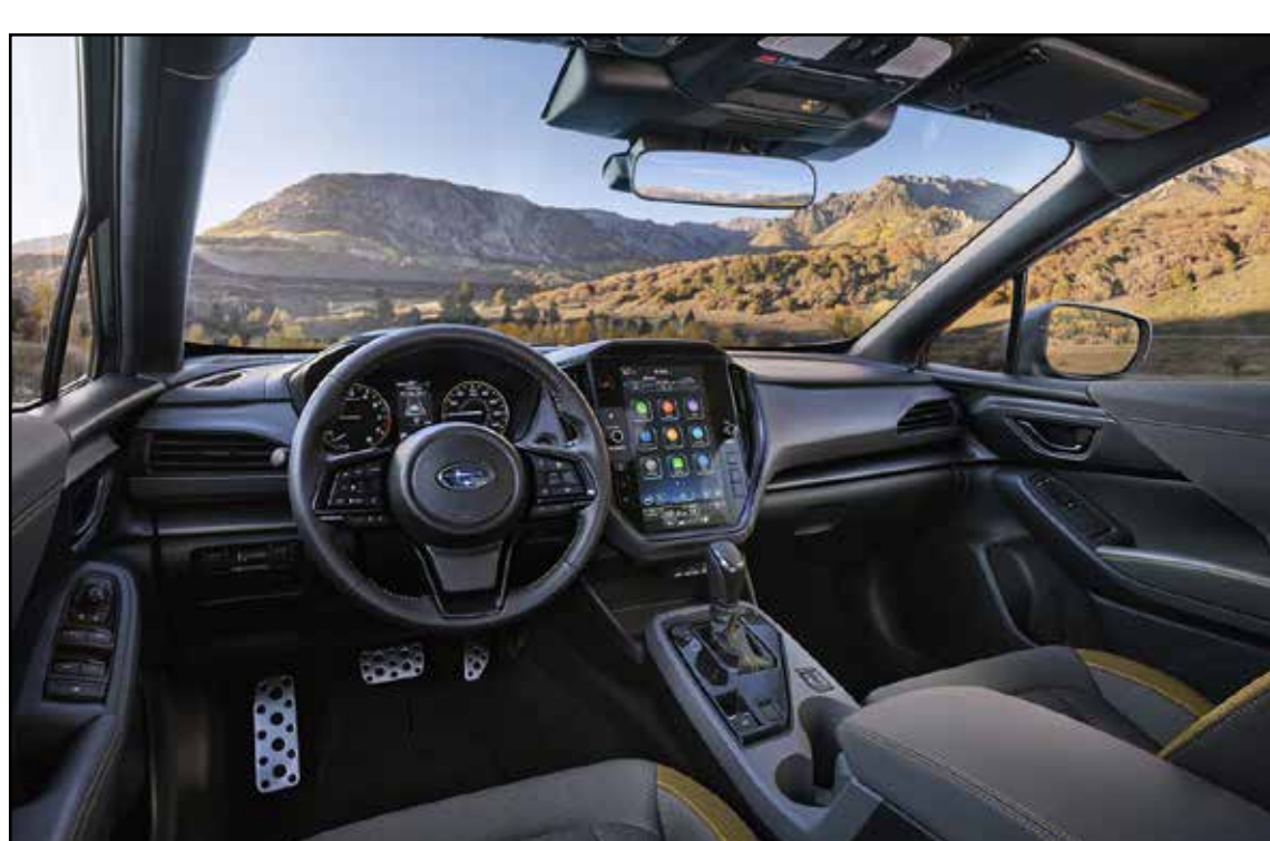
A quieter cabin and improved technology, including an available 11.6-inch touchscreen, enhance the new Crosstrek's daily livability.

This improvements in driving dynamics don't come at the expense of the model's