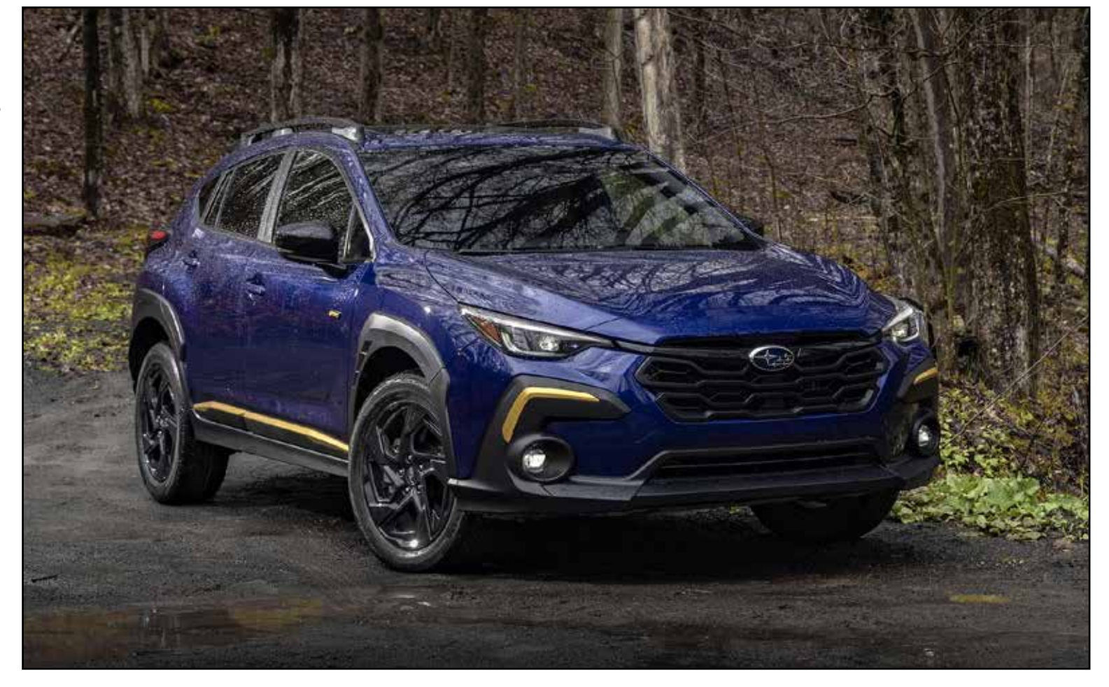
The Crosstrek's new-for-2024 design maintains its rugged character while incorporating subtle refinements.

from thoughtful updates, including the availability of a new 11.6-inch touchscreen infotainment system.