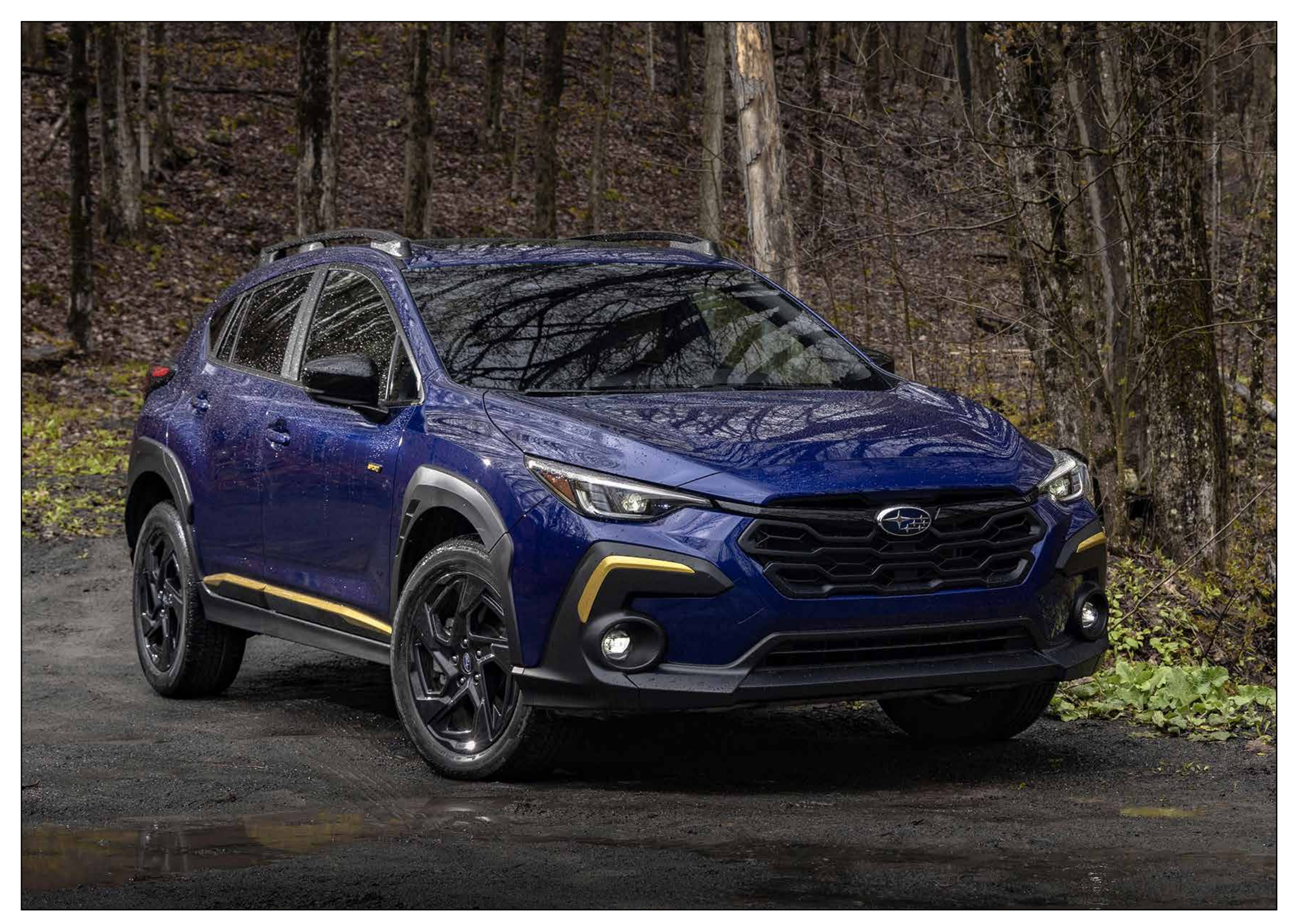
The Crosstrek's new-for-2024 design maintains its rugged character while incorporating subtle refinements.