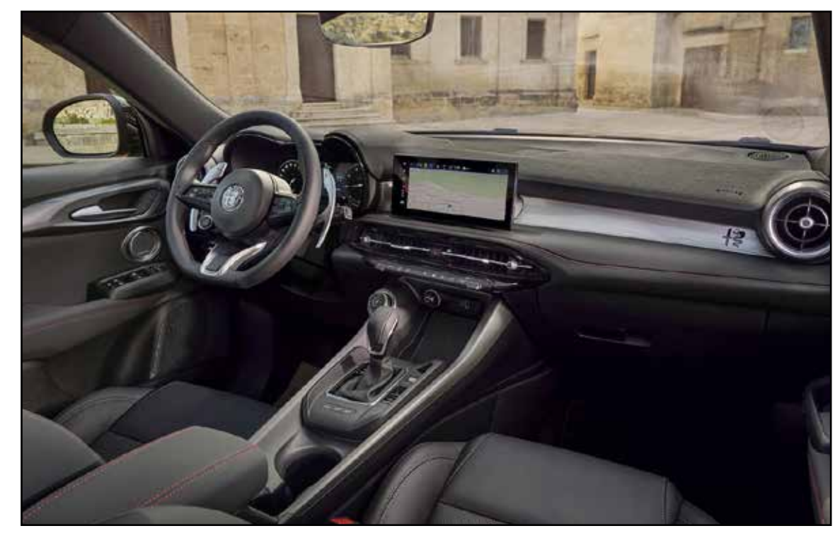
Premium materials and driver-focused ergonomics reflect Alfa Romeo's sporting heritage, while modern technology keeps the Tonale thoroughly contemporary.

The Tonale's Italian heritage is evident in its striking design. My tester's Verde Fangio metallic paint ($2,200) drew constant attention and compliments, showing that Alfa