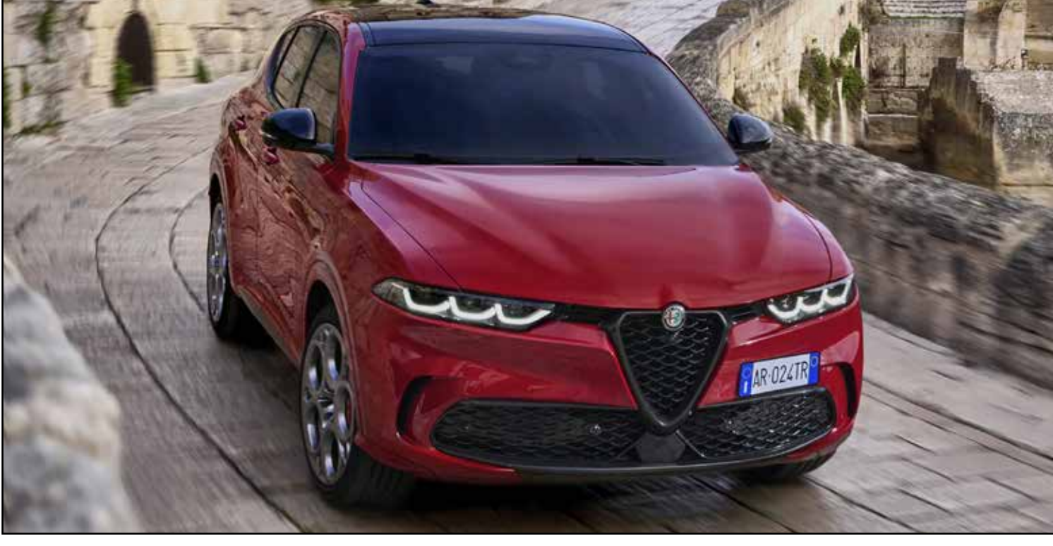
The Tonale's distinctive Italian design creates an unmistakable presence in a crowded segment.

The Tonale's Italian heritage is evident in its striking