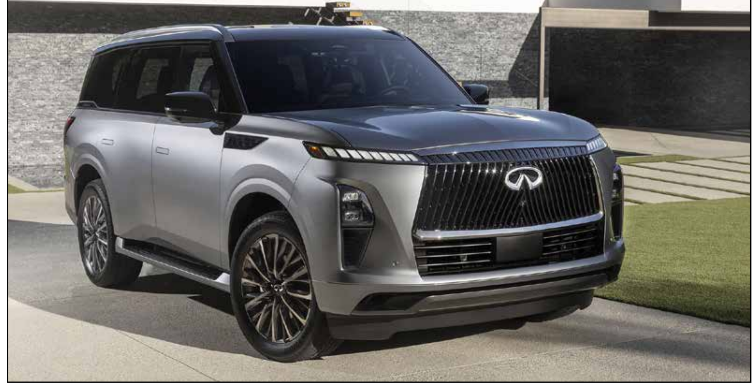
With its two-tone roof treatment and unique 22-inch wheels, the QX80 Autograph subtly announces its flagship status.

Technology is seamlessly integrated throughout the cabin. Dual 14.3-inch displays dominate the dash-