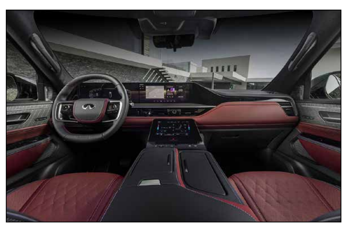
Hand-finished leather quilting and aluminum-inlaid wood trim create a bespoke atmosphere in the QX80 Autograph's three-row cabin.

Technology is seamlessly integrated throughout the cabin. Dual 14.3-inch displays dominate the dashboard, while ProPILOT Assist 2.1, standard on the Autograph, allows for hands-free driving in certain highway conditions.