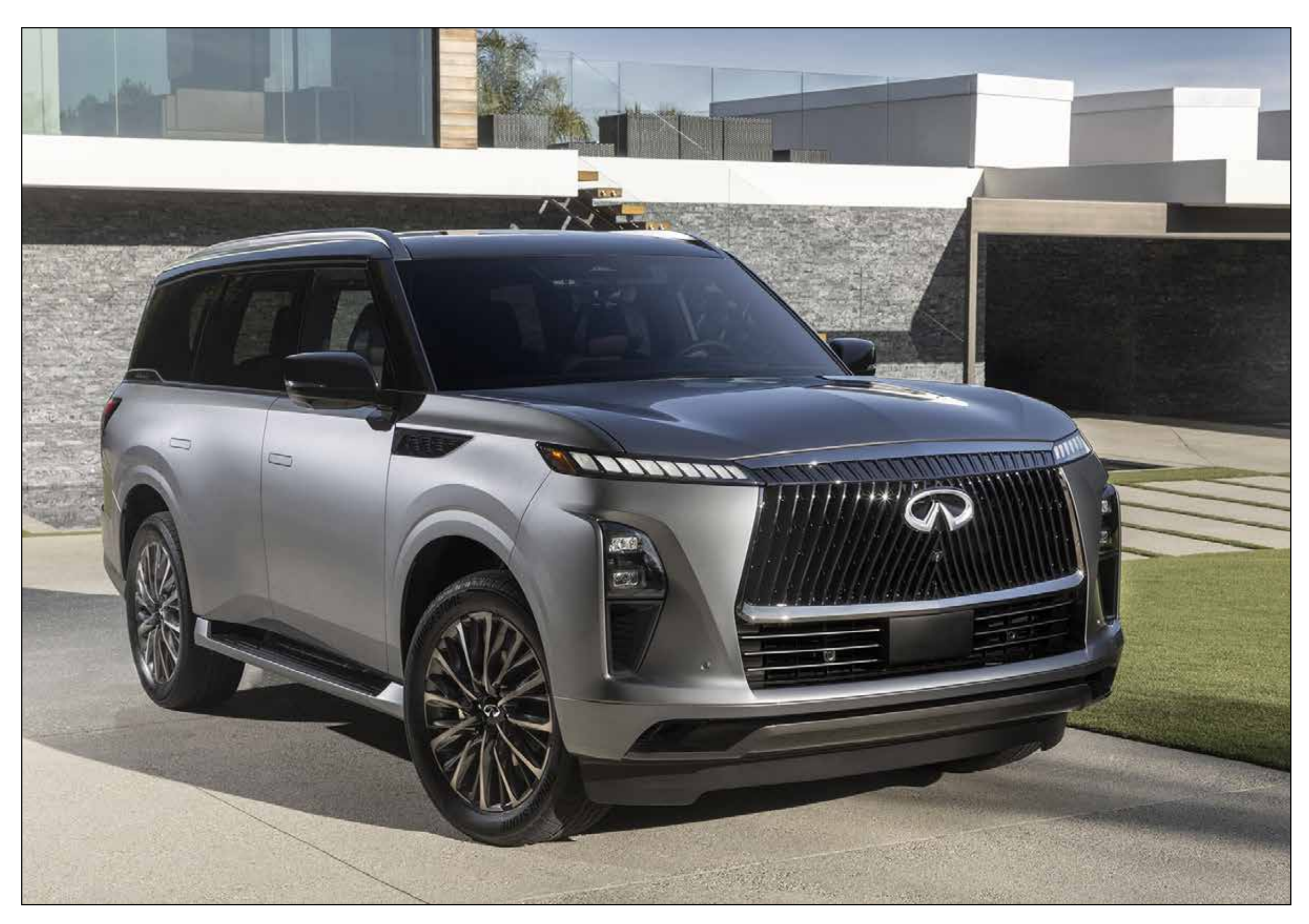
With its two-tone roof treatment and unique 22-inch wheels, the QX80 Autograph subtly announces its flagship status.