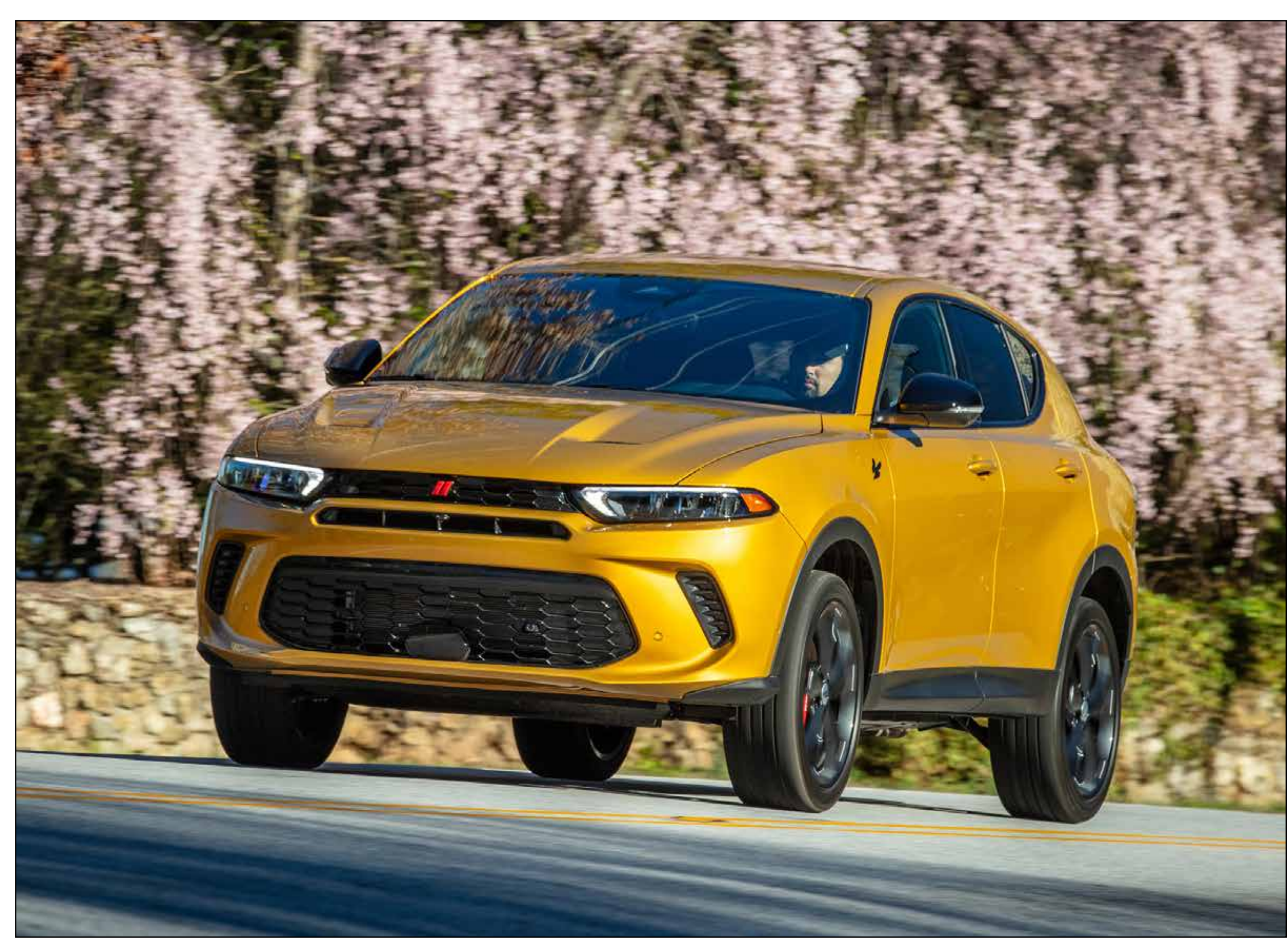
With its aggressive styling and athletic stance, the Hornet successfully translates Dodge's performance heritage into crossover form.