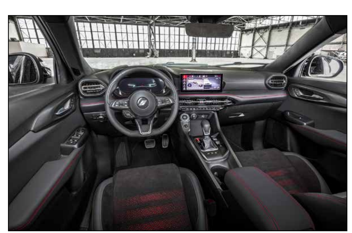
The Hornet's driver-focused cockpit features modern technology and good build quality, though rear seat space is tight compared to some rivals.

Visually, the Hornet makes a strong statement. Its sleek, aggressive styling successfully translates Dodge's performance heri-