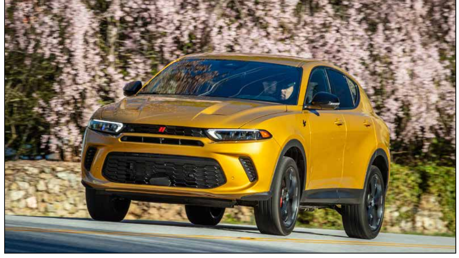
With its aggressive styling and athletic stance, the Hornet successfully translates Dodge's performance heritage into crossover form.

Visually, the Hornet makes a strong statement. Its sleek, aggressive styling suc-