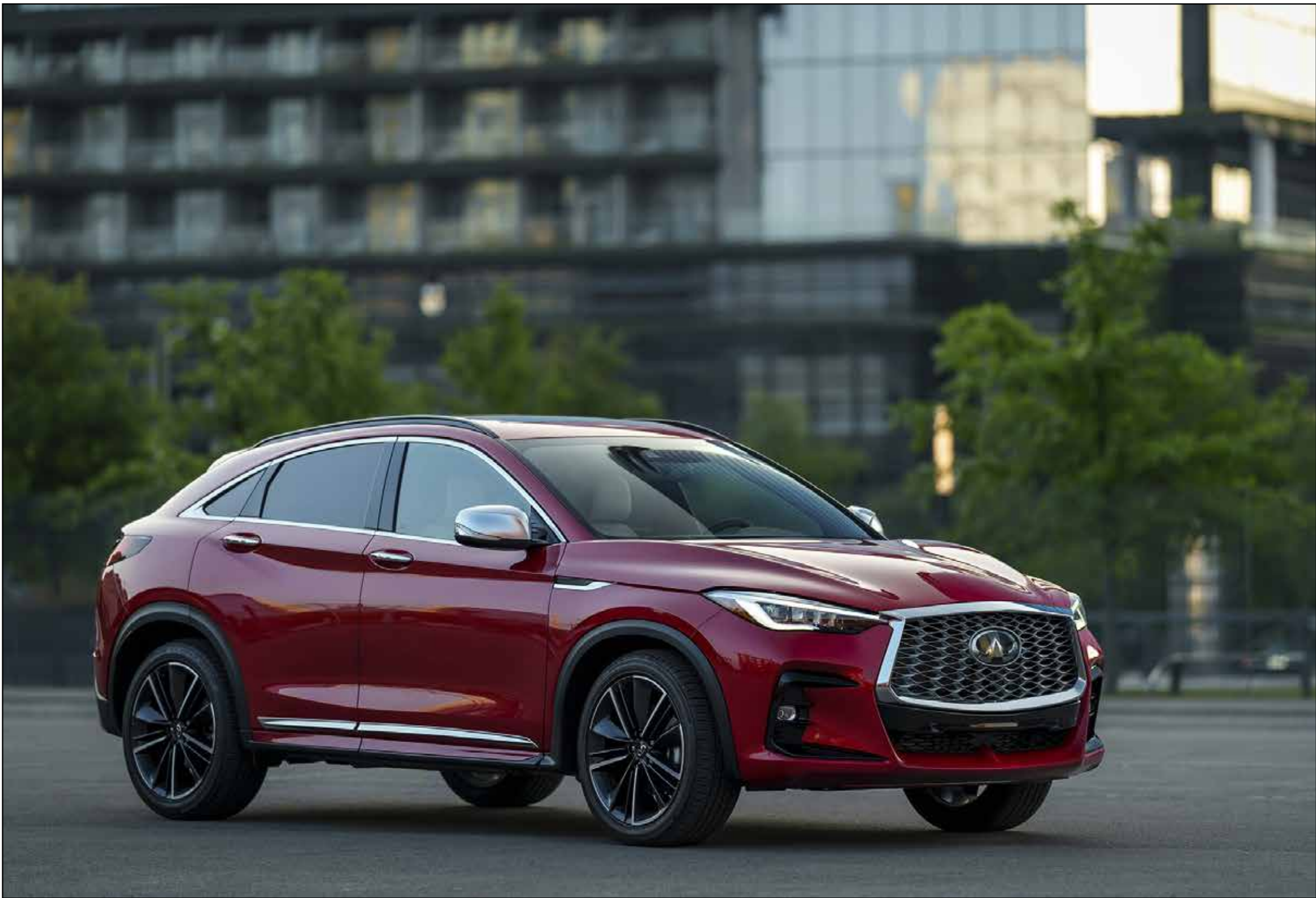
With its swooping roofline and bold grille, the QX55 cuts a striking figure that sets it apart from more conventionally styled luxury crossovers.