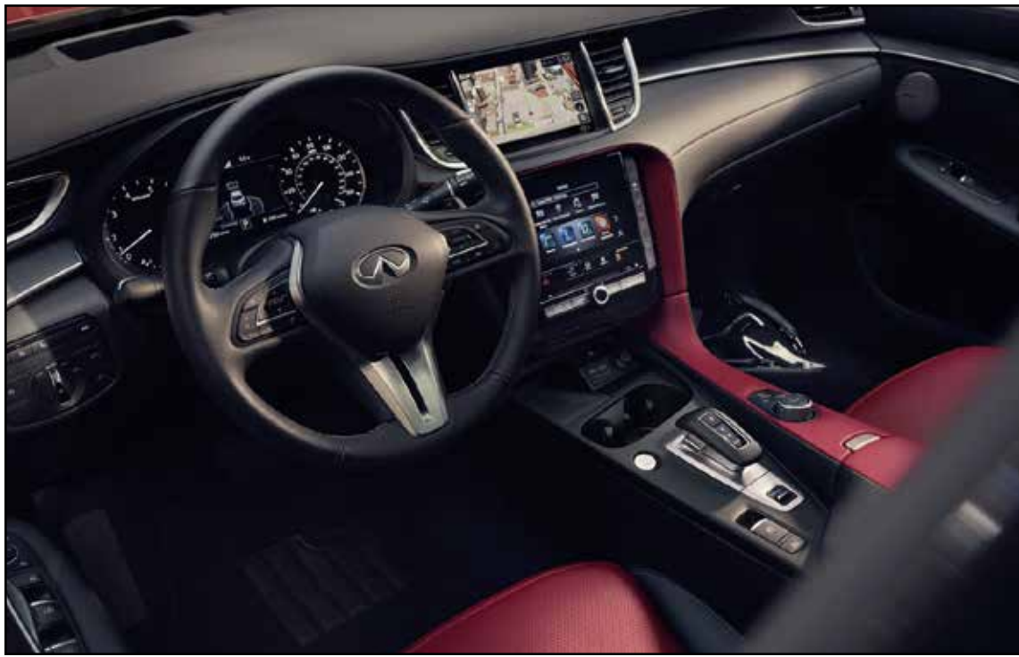
Premium materials and attractive design elements create an upscale ambiance in the QX55's cabin, complemented by a dual-screen infotainment system with wireless smartphone integration.

Visually, the QX55 is a standout. Its flow-