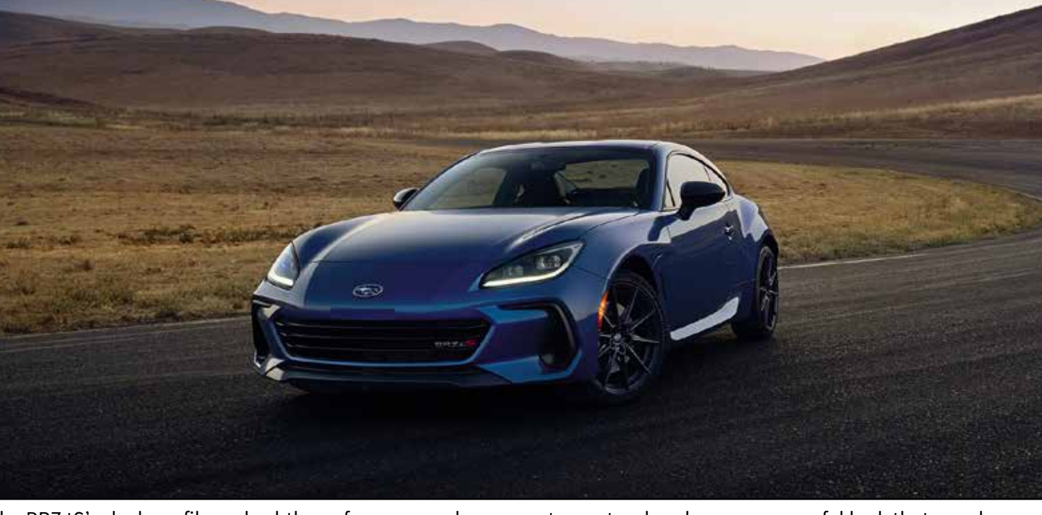
The BRZ tS's sleek profile and subtle performance enhancements create a handsome, purposeful look that punches above its price class.

in the tS model that I tested offers even sharper responses without significantly compromising ride quality. The Brembo braking system provides strong, fade-resistant stopping power, inspiring confidence during spirited driving.