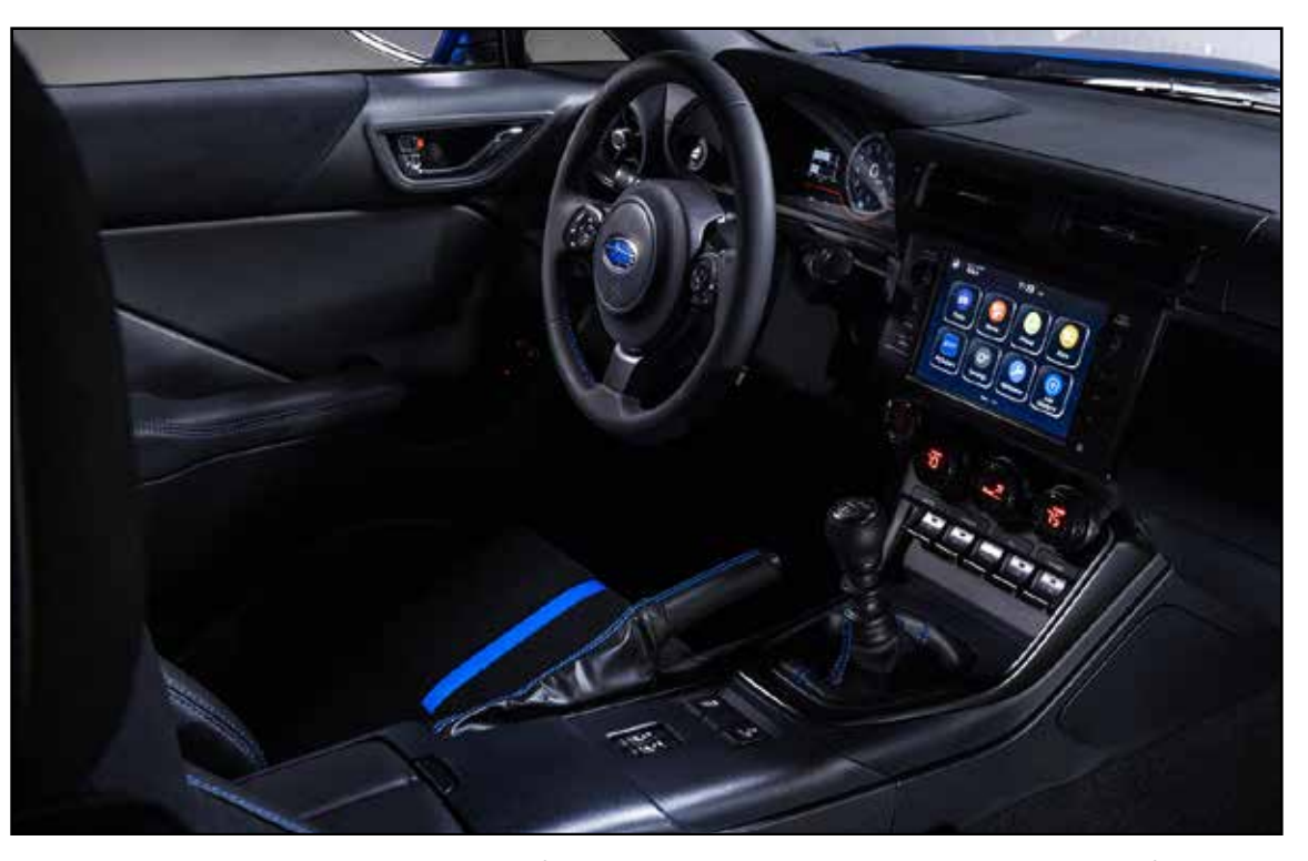
While not luxurious, the BRZ's driver-focused cockpit provides all the essentials for an engaging driving experience, with supportive seats and well-placed controls.

The STI-tuned suspension in the tS model that I tested offers even sharper responses without significantly compromising ride