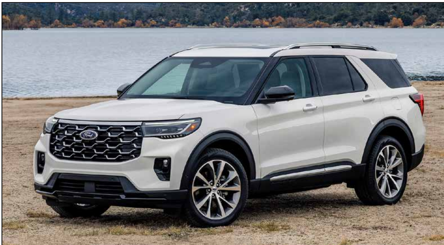
The 2025 Ford Explorer wears broad shoulders and a bold grille that emphasize its traditional SUV stance.

The Explorer's styling remains broad-shouldered