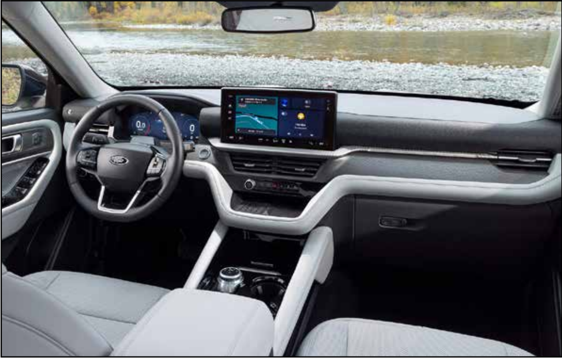
A large 12.3-inch touchscreen and roomy seating highlight the Explorer's modern, family-friendly cabin.

The Ford Explorer has been a household name for decades, and the 2025 update reminds you why. It's not trying to be flashy or reinvent the segment. It's about delivering comfort, versatility and a confident presence on the road. From the driver's seat, the first impression is smoothness. Even in the base-level Active trim, the cabin is impressively quiet at highway speeds, filtering out the sort of wind and road noise you'd expect in this price class. The ride feels tuned for comfort, with suspension compliance and plush, squishy seats that encourage long-haul road trips. Power comes from a 2.3-liter turbocharged four-cylinder with 300 horsepower, a spec that feels plenty strong in practice. Merging and passing require just a jab of the gas pedal, and the 10-speed automatic does a good job of keeping the engine in its sweet spot. The four-cylinder also helps the Explorer return respectable fuel economy for its size, with EPA ratings of 20 mpg in the city and 27 on the highway, solid numbers for a three-row SUV with this much muscle. The Explorer's styling remains broad-shouldered and brawny, giving it the stance of a traditional SUV even though it drives more like a crossover.