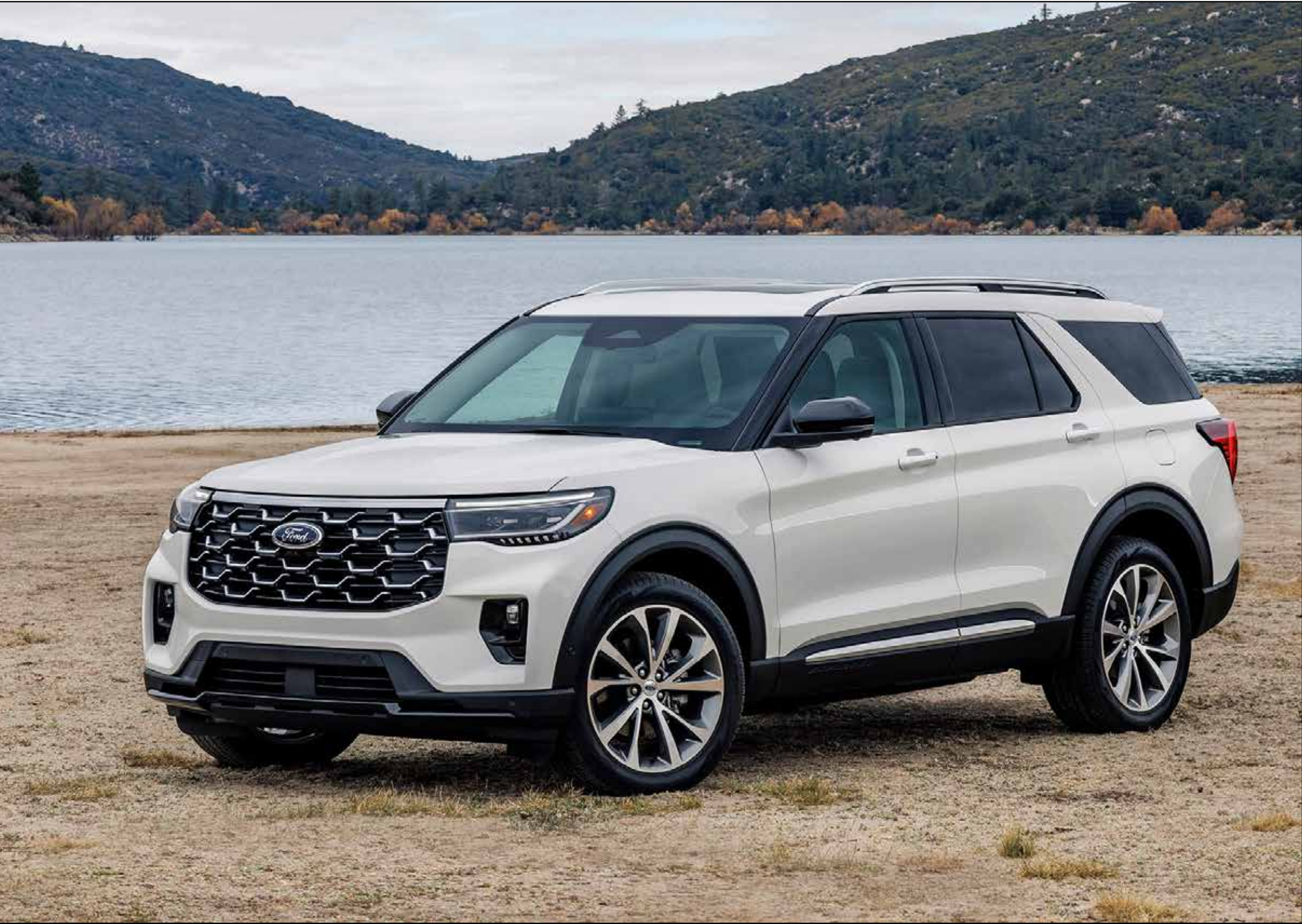
The 2025 Ford Explorer wears broad shoulders and a bold grille that emphasize its traditional SUV stance.